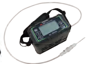
Appearance with accessories attached